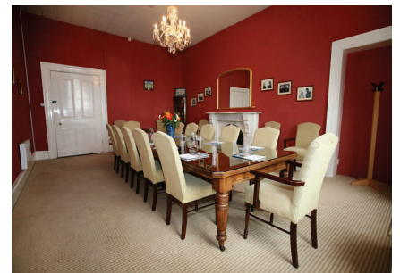
Possible Room Lay-outs

Ideal for Board Meetings and small meetings for up to 16 people.