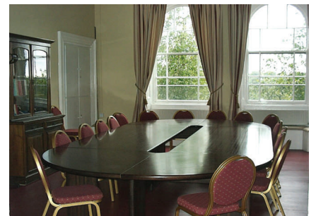
Possible Room Lay-outs

Ideal for Board Meetings and small meetings for up to 16 people.