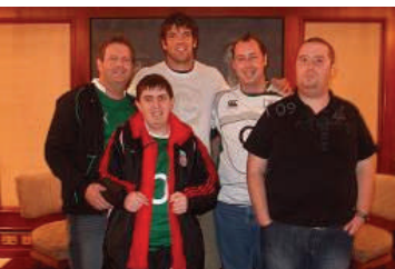
Donncha O'Callaghan with some of the JASS service users.

A group of the lads from JASS met up with some members of the Irish Rugby Team recently. They met Paul O' Connell, Jamie Heaslip, Don-